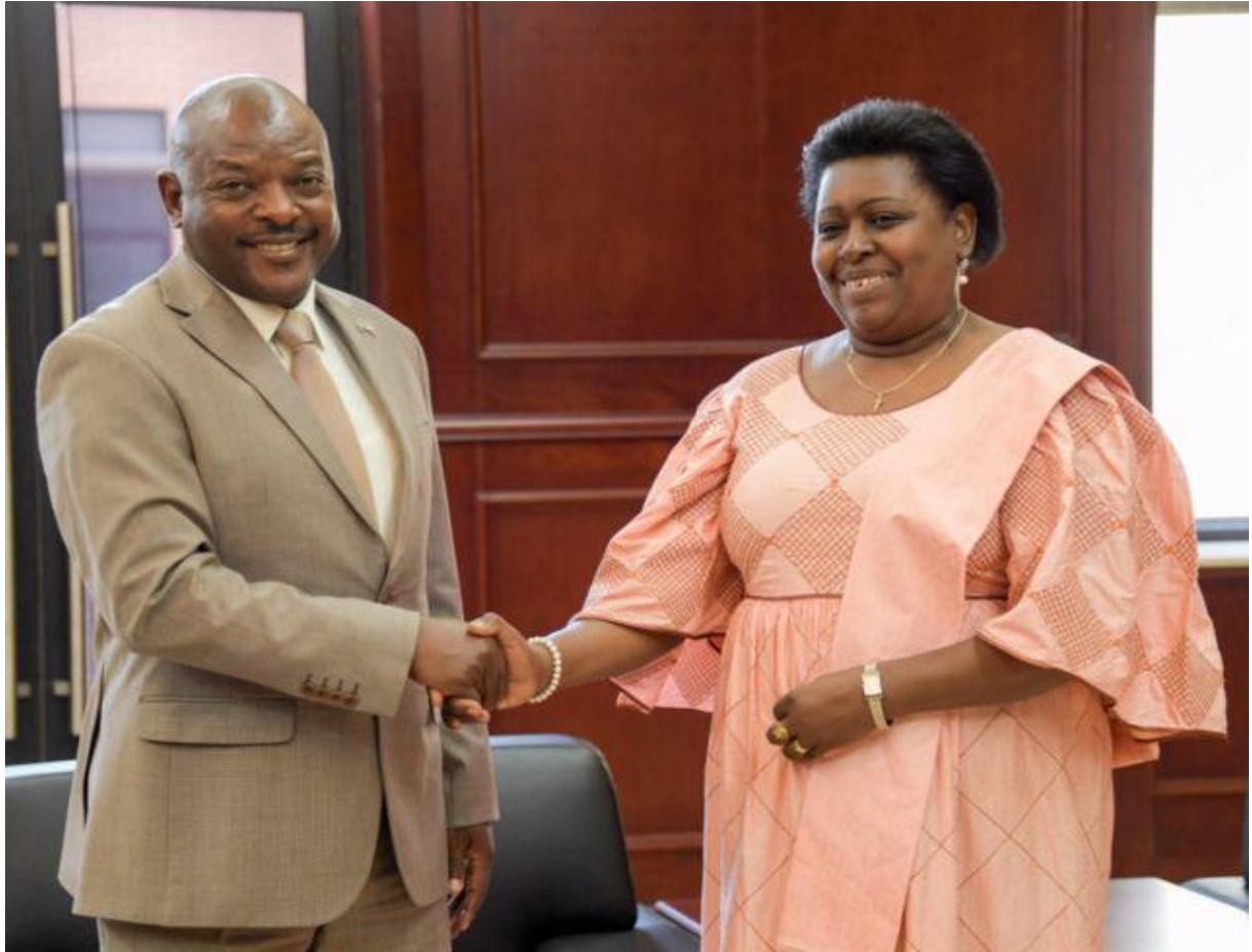
,NTARE RUSHATSI HOUSE