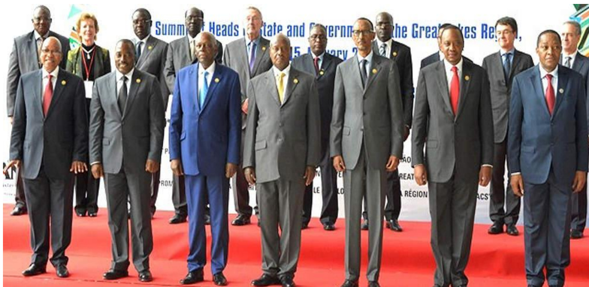
Ifoto y'abakuru b'ibihugu bigize CIRGL ubwo bari mu nama yabo muri Angola taliki ya 14/08/2014