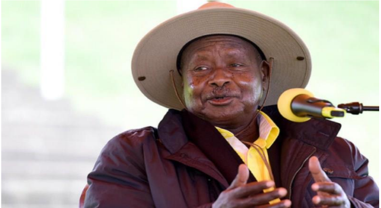
Perezida wa Uganda, Yoweri Kaguta Museveni akomeje gushishikariza ibihugu kwiyumora kuri ICC