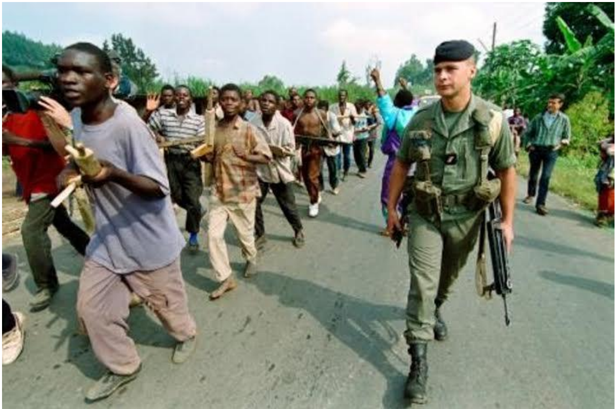
Abafaransa bigishaga Interahamwe gukoresha imbunda, ibyuma n'ibindi bikoresho byifashishijwe mu bwicanyi mu gihe cya Jenocide