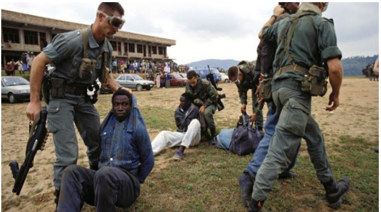
Usibye gutoza Interahamwe, Abasirikare b'Abafaransa bagize n'uruhare kuri za bariyeri mu bikorwa byo gufata abitwaga ibyitso

Dr Bizimana Jean Damascene , Umunyamabanga Nshingwabikorwa