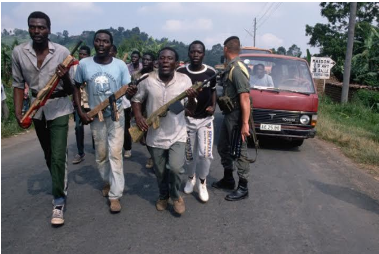
Abasirikare b'Abafaransa bagize uruhare mu gutoza interahamwe zakarabye inkaba