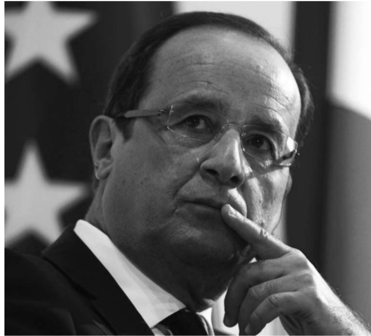
Francois Hollande.

6. Kuki tariki ya 17 Nyakanga 1994, Abasirikare b'Abafaransa bihutishije ibikorwa byo guhungisha Guverinoma yari irangije gukora Jenocide ikerecyezwa