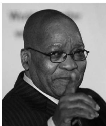
Jacob Zuma.

Intambarahagatiy'uRwanda na Tanzania bizaba bivuze intambara hagati ya Tanzania na Uganda. Umuryango wa Afurika y'uburasirazuba nawo uzaba iyinjyemo