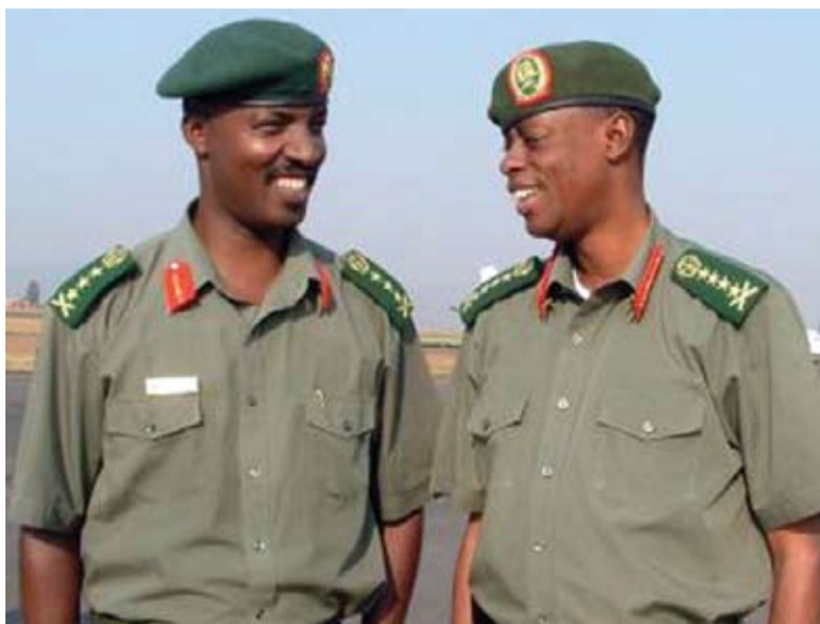
Ingabo z'u Rwanda ziri maso.

Iyo nama yanitabiriwe n'abanyekongo baje gutungura abantu ubwo bavugiraga ku