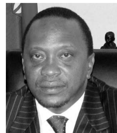
Uhuru Kenyatta.

kandi buri gihugu gifite aho kibogamiye. Amateka uko yigaragaza n'uko Kenya ya Uhuru Kenyatta itajya ku ruhande rwa Tanzania nk'uko n'u Burundi bwa Petero Nkurunziza butatererana u Rwanda. Muri EAC Tanzania izaba iri yonyine, kandi ibi yakabaye ibitekerezaho cyane. Izaza irwana n'u