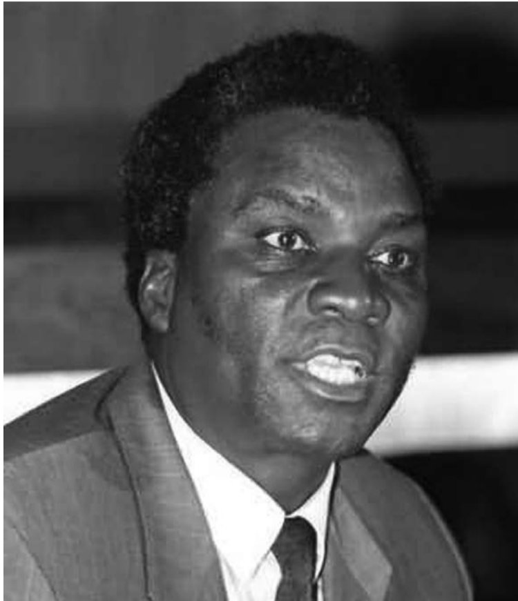
Habyarimana.

18. Kubera iki muri Gicurasi 1994, u Bufaransa, binyuze mu ijwi rya Bernard Kouchner na Guverinoma yakoraga Jenoside, basabye ko intambara yahagarara hagati ya FPR n'intagondwa z'Abahutu ? Aha bivugwa ko bwari uburyo bwo guhagarika ibikorwa bya FPR ahubwo hagakomeza