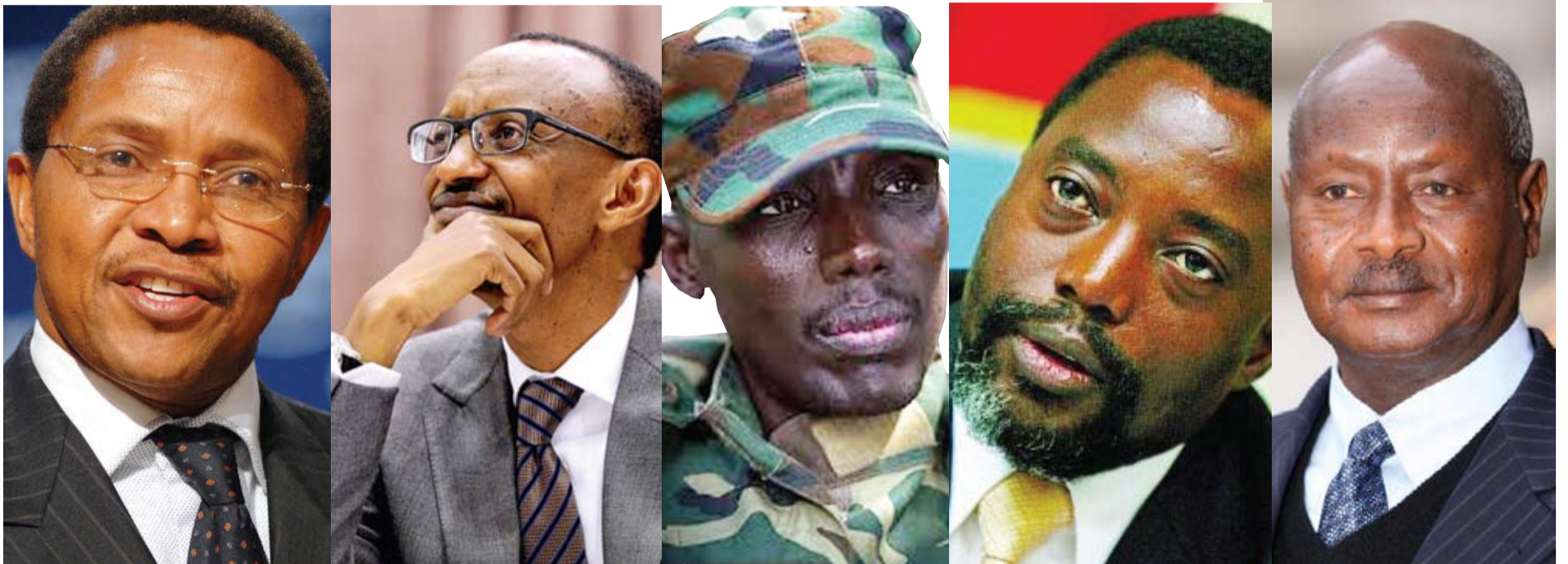
Kikwete, Kagame, Makenga, Kabila na Museveni.