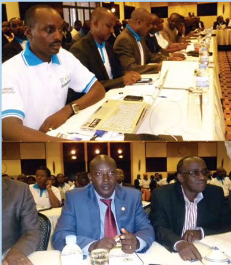
Abayobozi b'uturere bari bitabiriywe iyo nama.

Twabibutsa ko RGB yabonye ko imiryango ya sosiyete sivile itagera neza kubaturage , byatumye mu gusoza ukwezi kw'imiyoborere guhuzwa n'igikorwa cyo gutera inkunga imiryango itegamiye kuri Leta n'abikorera bagaragaje imishinga ifite ireme yo guteza imbere imiyoborere myiza mu