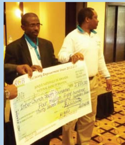
Imwe mu miryango itegamiye kuri leta yabonyeibihembo.