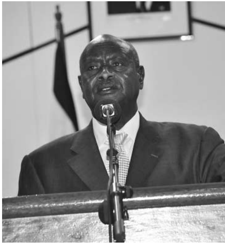
Perezida Yoweri Museveni.

Iyi nteko yigaga ku buryo hashyirwaho isoko rimwe rihuriweho n'ibihugu byose