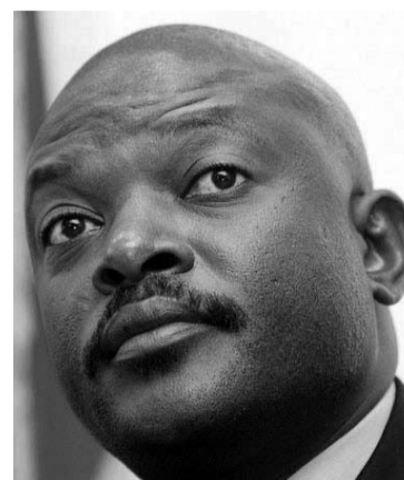
Pierre Nkurunziza.