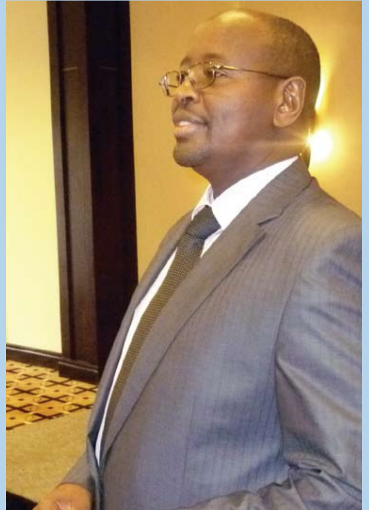
Minisitiri James Musoni niwe wafunguye inama ya "High Level Policy Dialogue".

Abajyanama kandi bongeye gusomerwa amwe mu mategeko abagenga harimo gufata ibyemezo no kumenya uko bishyirwa mu bikorwa ariko basabwa kwirinda kwivanga mu kazi ka buri muni