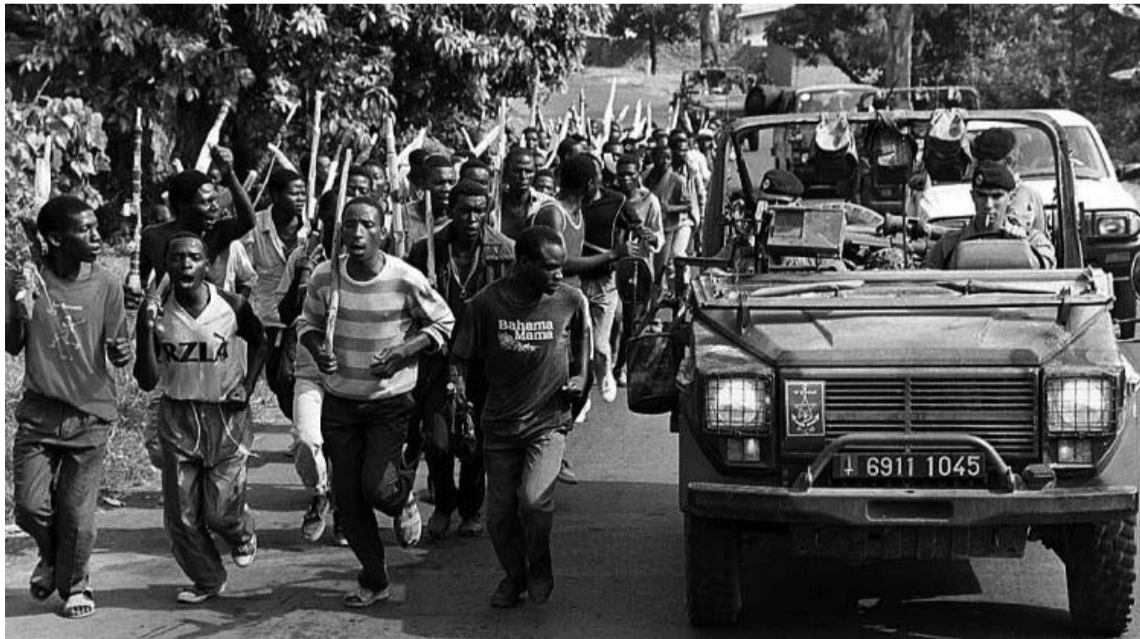
Interahamwe zatozwaga n'abafaransa.

13. Ese iyo raporo ntinyuranyaga n'inyandiko z'ibanga zanditwe mu mwaka wa 1994 zanditswe n'inzego z'ubutasi za Amerika nyuma zikagaragara mu binyamakuru zivugaga ko intagondwa z'Abahutu zahanuye indege ya Habyarimana ? (Urugero n'inyandiko ya Jim Lobe, ifite umutwe ugira uti "Rwanda-US : Papers Imply Hutu Hard-Liners Downed President's Plane, yanditswe kuwa 6 Mata 2004) "Dushyize mu Kinyarwanda ' U Rwanda